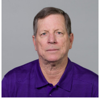
NORV TURNER Offensive Coordinator

Norv Turner enters his 30th season of NFL coaching in 2014 and his 1st as Offensive Coordinator of the Vikings. A veteran head coach and coordinator, Turner has 15 seasons as an NFL head coach under his belt and as an offensive coordinator for Dallas he helped the Cowboys win Super Bowl XXVII (vs. Buffalo, 1992) and XXVIII (vs. Buffalo, 1993).